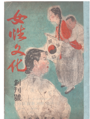
女性文化 1945 (여성문화 Yösong munhwa) / Women's culture, the first women's magazine published during the liberation period (1945-1950)

of subjects and includes short descriptions for each magazine. By romanizing and translating each publication's title and subject-related information, we have ensured that English-speaking scholars will be able to effectively utilize the Bibliography . Additionally, we include location information links which connect users to WorldCat, thus saving researchers time otherwise spent searching for holding information.