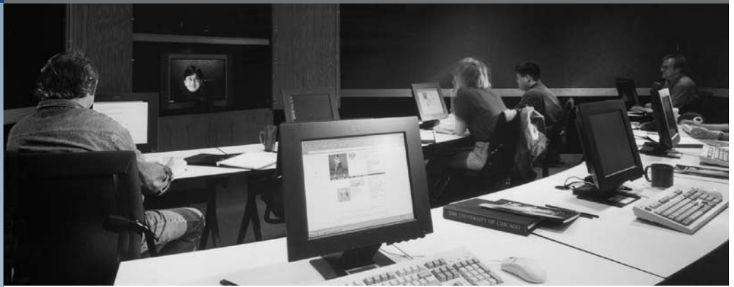
USITE/CRERAR Computing Cluster

Group studies are located on the 2nd and 3rd floors and are available to all users on a first-come/first-serve basis.