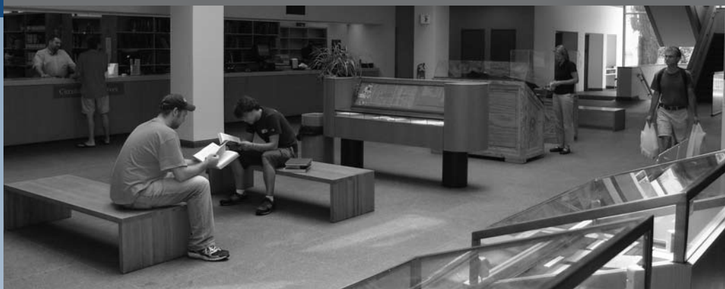
Crerar Library Atrium