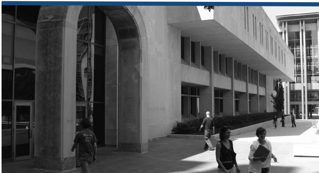
The John Crerar Library

The John Crerar Library is home to more than 1.4 million volumes in the biological, medical and physical sciences, as well as collections in general science and the philosophy and history of science, medicine, and technology. Most items can be located by searching the Library Catalog, which is available from the Library's web site: www.lib.uchicago.edu/e/crerar .