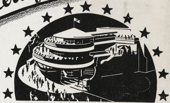
Wilson & Co. Exhibit Building, on Northerly Island, in the heart of the new Midway.