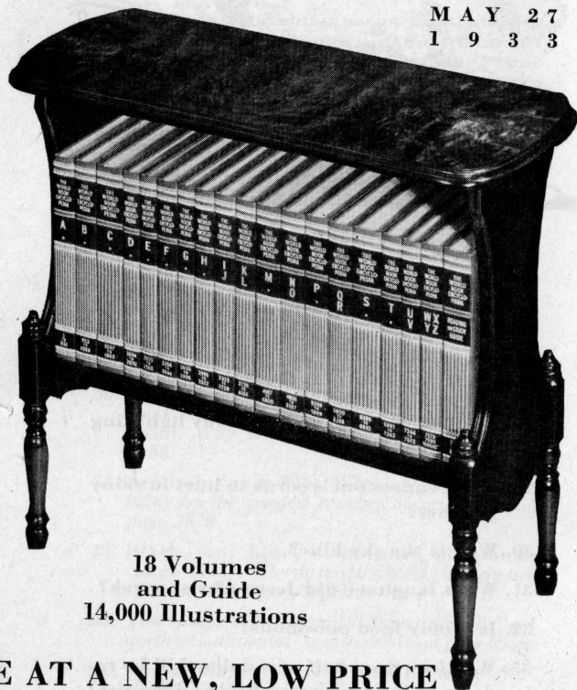
18 Volumes and Guide 14,000 Illustrations