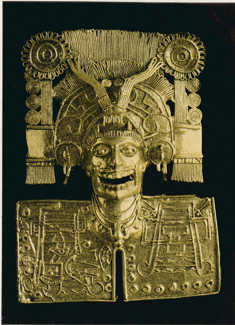
Gold Breast Plate. It Probably Represents the God of Death.