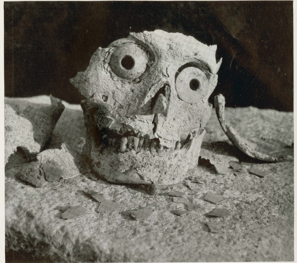
Human Cranium Decorated With Turquoise Mosaic.

To the right and left of this necklace two silver finger rings with symbolisms similar to those shown in Case Number VII.