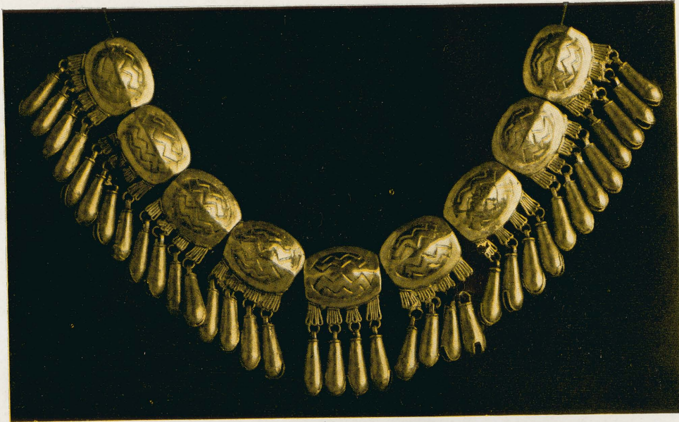
Gold Beads, Turtle Shell Shape.

Different samples of gold beads and rattles;