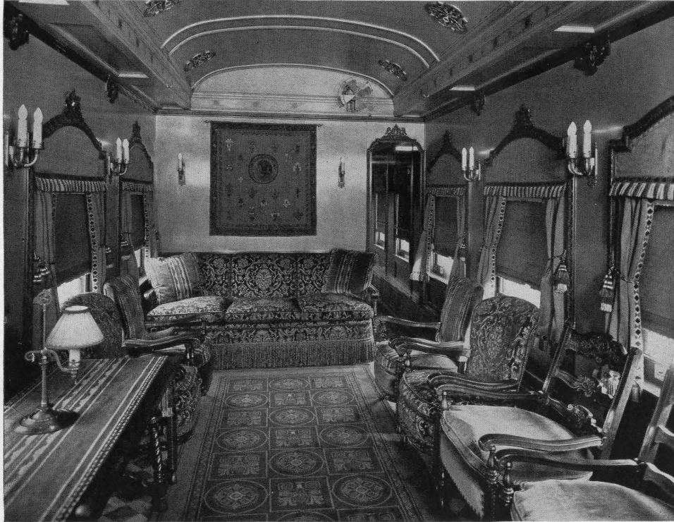
Reception Car on the Mexican Presidential Train.

was discovered—paintings, gold and jade jewels and wood carvings, all evidencing high artistic achievement.