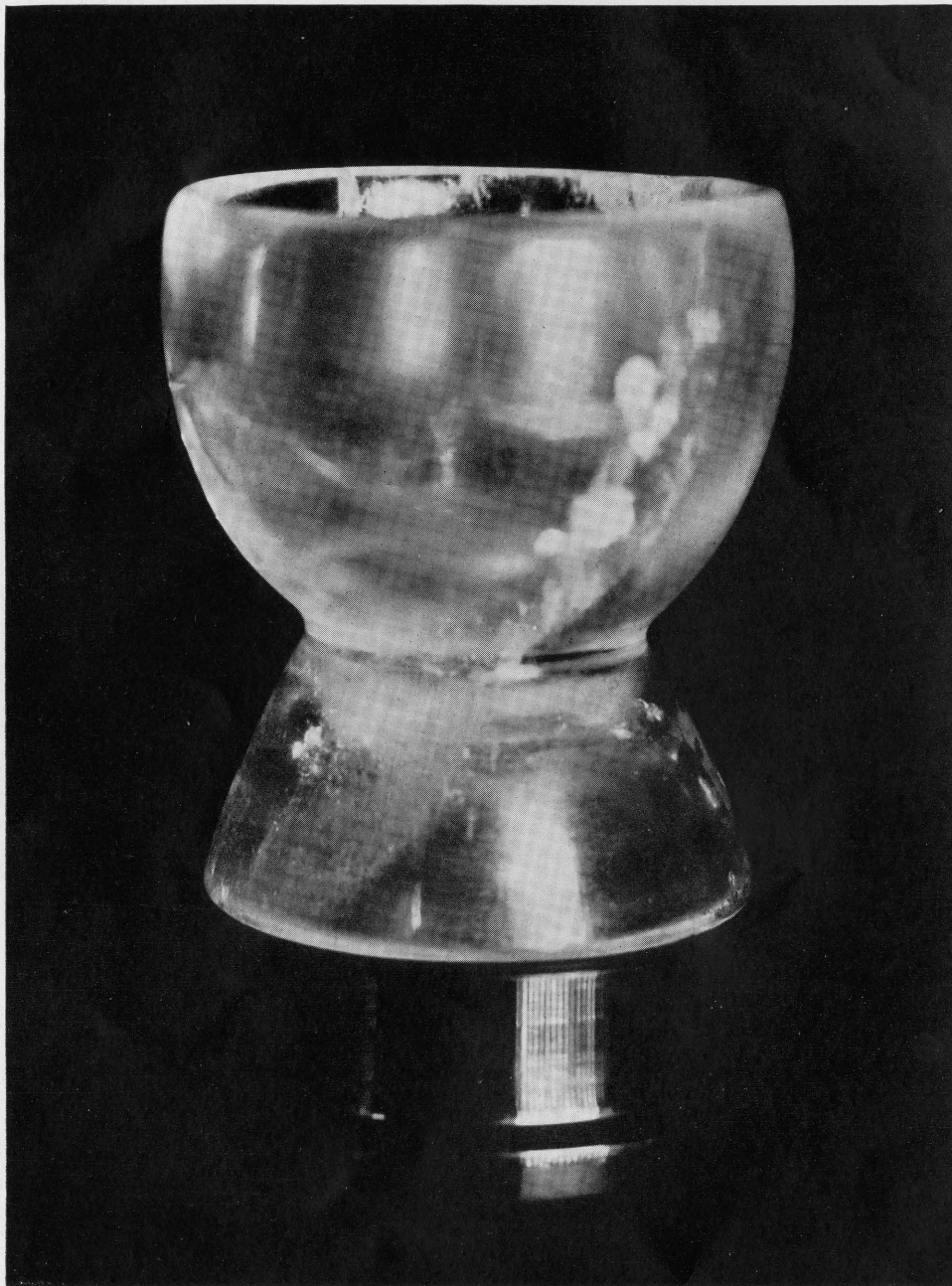
Rock Crystal Bowl, the Largest Ever Found on the American Continent.

of pure art on our continent, which stands by itself despite the fact that its symbolism is not yet understood; an art characterized by the strength of its design and strikingly suggestive of the pure lines of the pyramids.