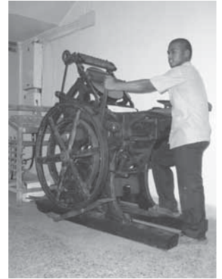
Treadle Press ca.1970, Amritsar

A separate division for Conservation of Library material was set up this financial year. One person from the Library received a travel grant from the Association of British Scholars, Chennai Chapter and University of Chicago to travel to England for receiving training in Conservation. Subsequently two of RMRL staff were trained in house to take up book mending, binding, making book jackets, polyester folders; encapsulating single sheet items, mounting pictures and de-acidification. A workshop was also organized to train other people in the region. [See more on workshops]. A number of people have approached RMRL for help in these areas.