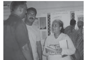
Scholars at Lecture