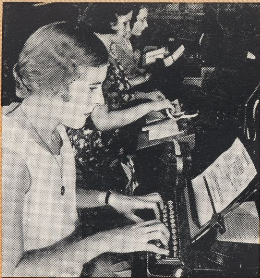
Sending a Telegram