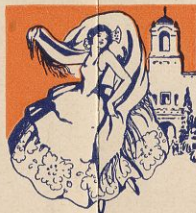
The Spanish Village

Sight-seeing Tours pass every important building, exhibit, amusement and show in the Fair. Buses roll along about 5 miles per hour and a college lecturer explains