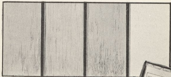
A photograph showing how panels looked at the end of the PTL Weatherometer test. On Fir and Cedar panels XLV (extreme right here) was the only paint which did not finally crack open to the wood.

A house paint improvement has been long overdue . . . and this Pittsburgh Testing Laboratory report makes it quite evident that the improvement is here . Never were paint users offered more convincing arguments for the use of a paint material. Thermo-lyzed Tung Oil XLV sets a new standard of quality in the paint field. It looks better. It protects better. It wears much longer. It's the modern economy paint!