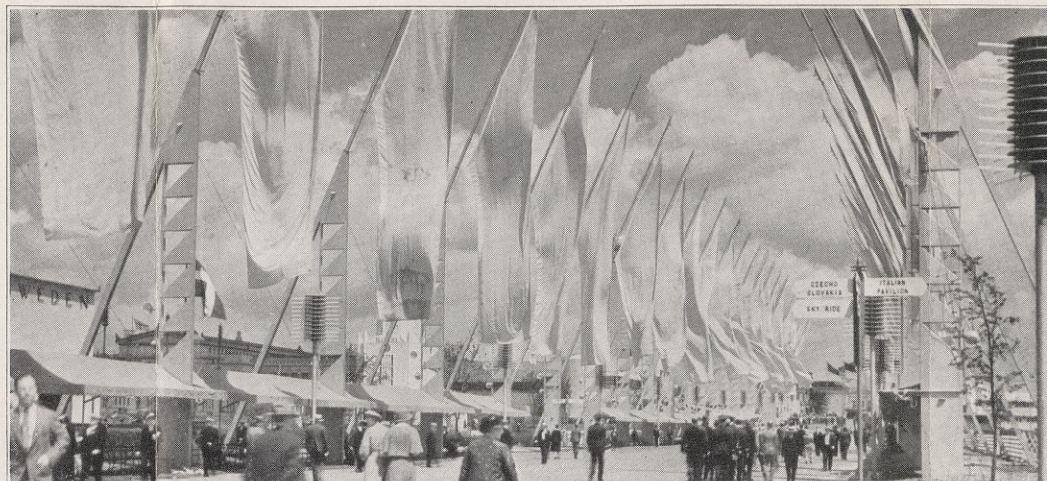
AVENUE OF FLAGS

SCIENCE YOU WILL UNDERSTAND WORLD FAMOUS BEACHES BOARD WALKS ON THE SHORES OF LAKE MICHIGAN WATER CARNIVALS