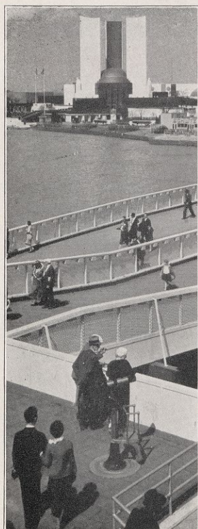
HALL OF STATES