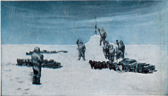
Reduced reproduction of Diorama PEARY AT THE NORTH POLE

Developed with 'TABLOID' 'RYTOL' DEVELOPER Toned with 'TABLOID' BLUE TONER