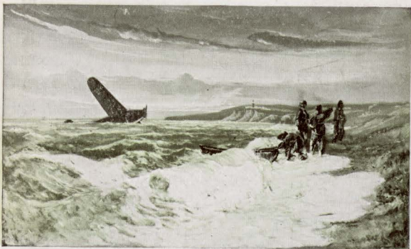
Reduced reproduction of Diorama BYRD LANDING IN FRANCE AFTER HIS TRANSATLANTIC FLIGHT

Developed with 'TABLOID' 'RYTOL' DEVELOPER Toned with 'TABLOID' GREEN TONER