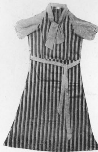
No. 400 STRIPE COTTON CREPE. House dress