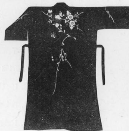
No. 600 COTTON CREPE Embroidered Kimono

is attached and should any defect or stain be discovered an indication is made to the said effect and at the end of each piece the word "End" is stamped.