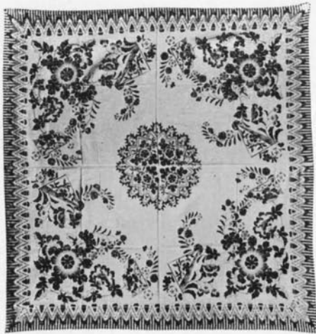
No. 700 COTTON-CREPE Printed Table Cloth 60" × 60"

washing. This is a distinct advantage over other makes of cotton fabrics, so that cotton crepe is most economical.