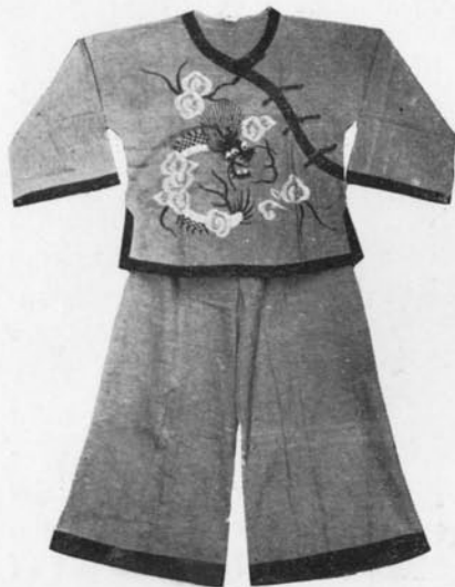
No. 600 YARNDYE CREPE Embroidered 2 nd Pyjama