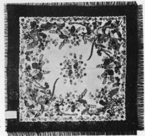
BRCCADE RAYON Printed Table Cloth with lillian fringe 36" × 36"

Yokohama is the centre of the Cotton crepe and Poplin business which is prospering owing