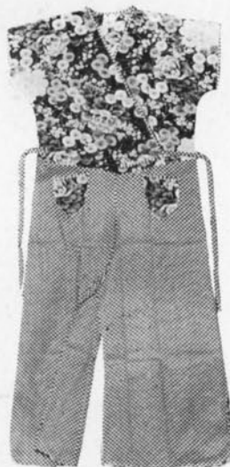
COTTON CHALLIES 1 st Pyjama

Principal cotton goods which are now being exported are as follows :