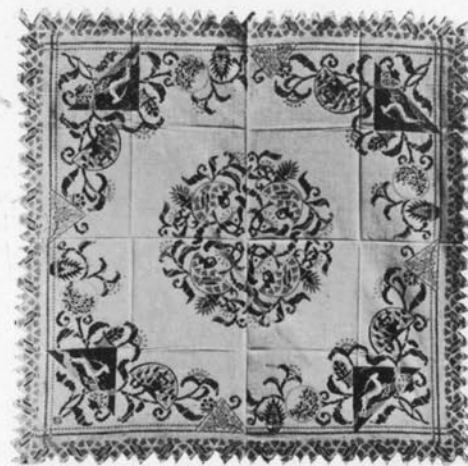
No. 700 COTTON CREPE Printed Table Cloth 60' x 60"

The special method by which crepe is woven makes it soft and pleasing to the most sensitive skin.