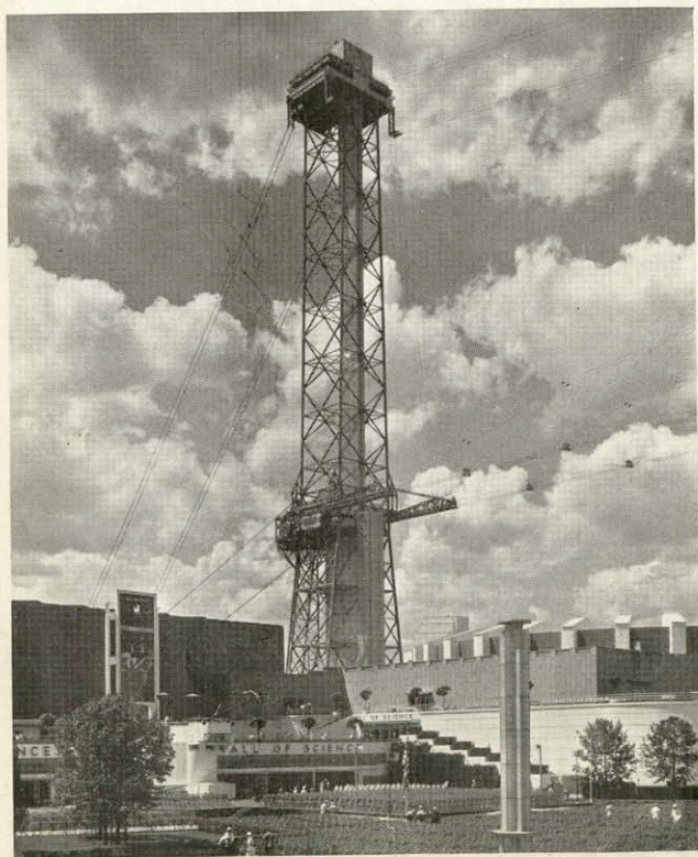
West Tower of the famous Sky Ride, unique thrill of the Fair

Division Passenger Agent Rock Island Station Telephone Kenwood 4100 Davenport, Iowa