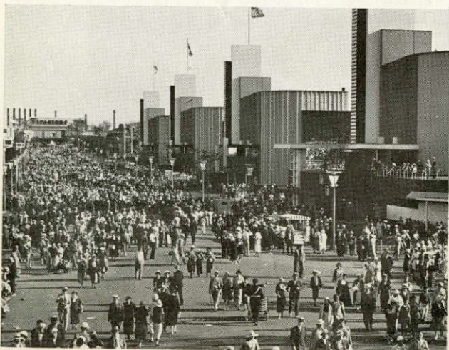
The General Exhibits Building always attracts a merry throng

Our patrons will stay at Palmer House where rooms with private bath will be provided—two persons to a room, unless request is made for single room or for one accommodating three or more persons.