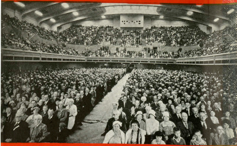
Public Evangelistic Service, Long Beach, California