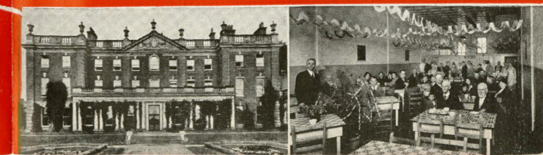
"Penny-a-dish Cafeteria, Shreveport, Louisiana