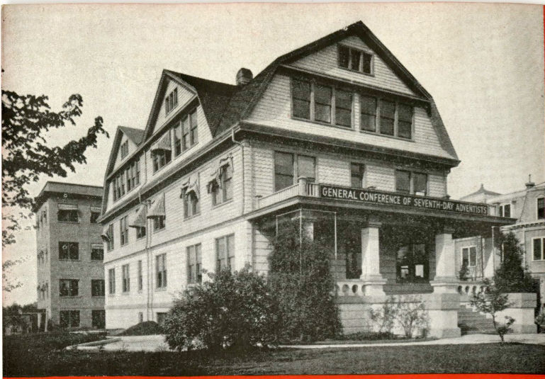
World Headquarters, Washington, D. C.