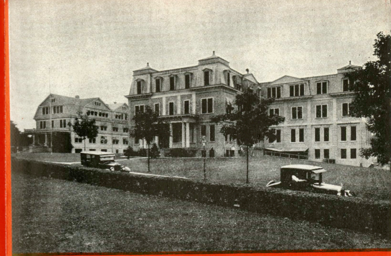
Review and Herald Publishing Association

An important department of the General Conference of Seventh-day Adventists is the Religious Liberty Association, whose avowed purpose is to uphold the true principles of civil and religious liberty as opposed to religious legislation — the restriction of the inalienable rights of conscience. Their official organ, "The Liberty Magazine," is published at Takoma Park, Washington, D. C.