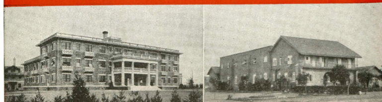
Oriental Watchman Publishing House, India