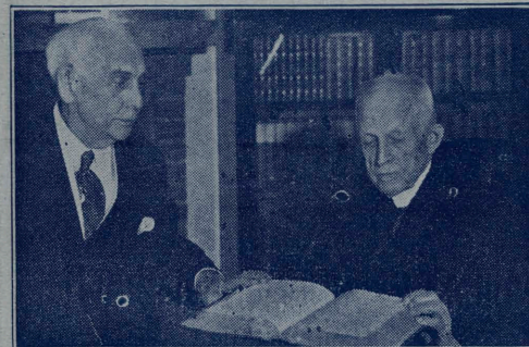
By the Comfort of the "Word"

"Sunset Years" soon come to all of us. "Depressions" come and go, business may fail and friends prove untrue, but the comfort and peace to be found in the promises of the Word, never fail.