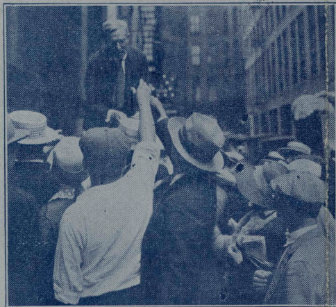
Noon Meeting in Arcade Court

Hurrying crowds soon forget the message of the preacher, but the "Silent Preacher," the printed Word, goes with the man into his office, his home and remains with him as he goes about his business.