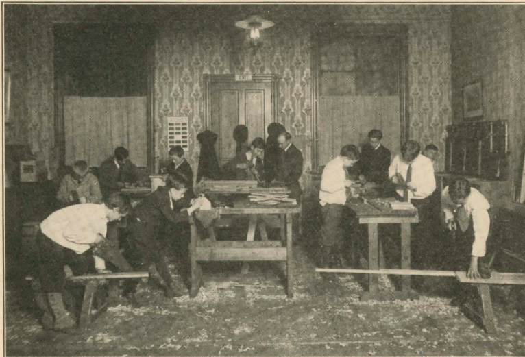
Manual Training Room