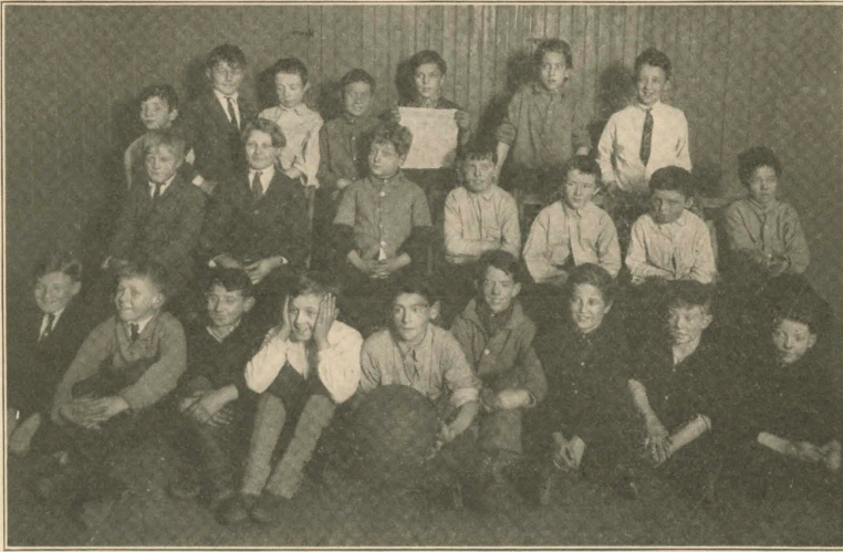
Basketball Teams—12-year-old boys